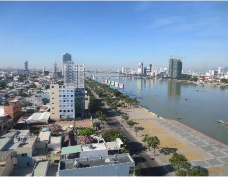
< _{ m Entrance} >