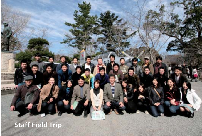
Staff Field Trip