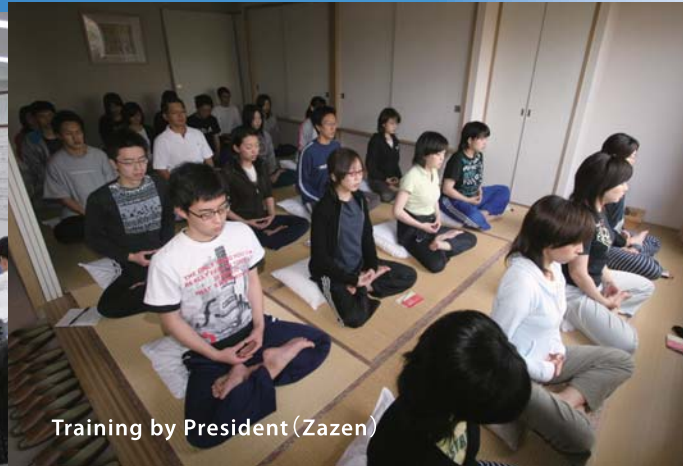
Training by President (Zazen)