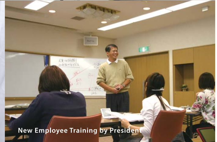
New Employee Training by President