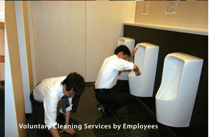
Voluntary Cleaning Services by Employees