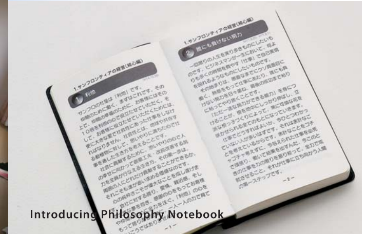
Introducing Philosophy Notebook